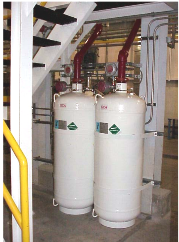
Fike HFC-227ea System Protecting a Flammable Liquid Storage Facility

creating a tremendous amount of heat. This promotes involvement of other flammable liquids stored in the hazard, which can happen instantaneously.